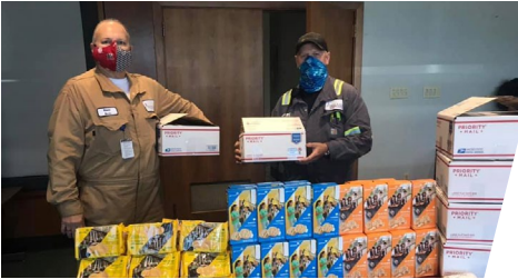
Care packages DECATUR AND PENSACOLA Throughout the year, Ascend Cares Decatur and Pensacola send care packages to active military personnel around the world. The care packages are sent to family members and friends of employees and contractors at both sites.

Volunteers in Tilburg donated gifts to Polish veterans through the charity organization Packed for the Heroes. The organization provides veterans with live-in special housing and easy-to-prepare food.