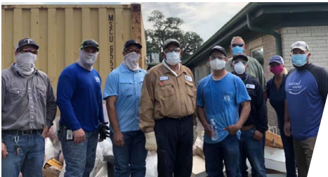
The Warrior’s Refuge CHOCOLATE BAYOU Ascend Cares Chocolate Bayou continues to partner with The Warrior’s Refuge to offer its veteran residents shelter, counseling, life resources and skills training. Volunteers from Chocolate Bayou renovated the organization’s kitchen and dining room. The project included replacing ceilings and walls, painting, installing kitchen countertops and expanding the pantry. With these improvements, The Warrior’s Refuge will be able to serve even more veterans who need help.