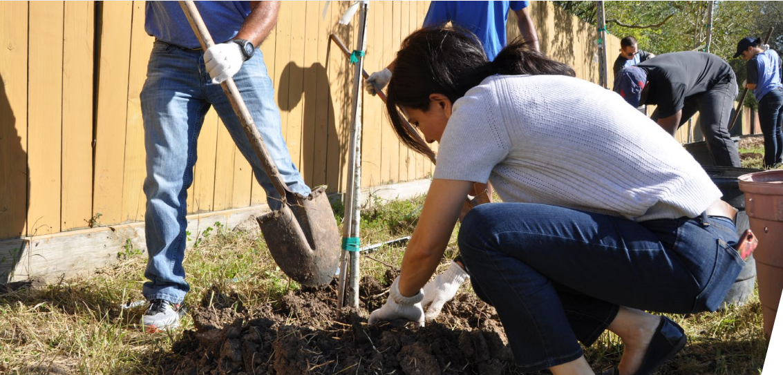
Trees for Houston at Camp Hope HOUSTON

Ascend Cares worked with Trees for Houston and Camp Hope to plant 23 trees around the facility’s new veteran family townhomes. Camp Hope provides a safe place for victims of trauma and post-traumatic stress events. Ascend Cares Houston has been working with both organizations for more than three years to support their missions.